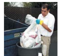
Use proper lifting techniques