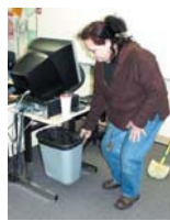
Bend your knees and keep your back straight.

Lifting's a breeze when you bend at the knees.