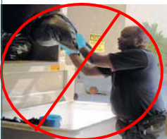
This cart forces employee to reach and work harder.