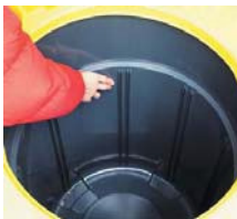
Use a barrel designed with