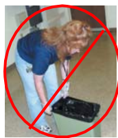
Do not stoop over to reline trash cans.

Lifting's a breeze when you bend at the knees.