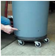
Use a barrel with holes.

Expect the unexpected. Gear up for safety.