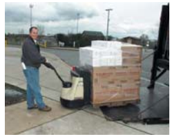
Use an electric pallet jack