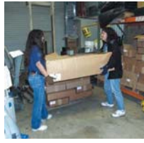
Get help and coordinate the move