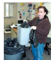
Remain upright while relining trash cans.