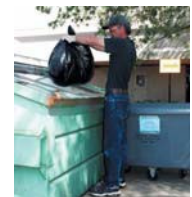
Face the dumpster, step closer and toss the bag straight ahead.