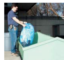
Drop trash bags into the dumpster.