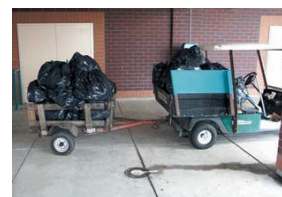
Use equipment to move trash bags closer to dumpster.