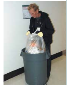
Use proper lifting techniques. Keep the load close to your body.